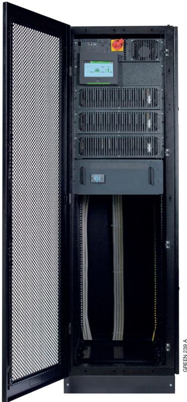
Example of integration (3x25 kW). Only 15 U of rack space occupied: space-saving design leaving free space for other rack-mounted devices. One empty slot in the MODULYS RM GP sub-rack remains available for power upgrade or redundancy.