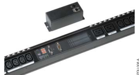
PDU 008 A

PDU VISION, WEB/SNMP manager interface for the connection to the LAN network. The device - suitable for remote monitoring – can be integrated into the PDU.