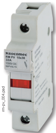
RM PV 10 x 38 32 A

for cylindrical photovoltaic fuses 10 x 38 and 14 x 51