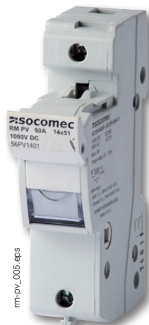
RM PV 14 x 51 50 A