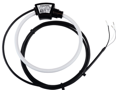
ROG 131 mV / 1 kA